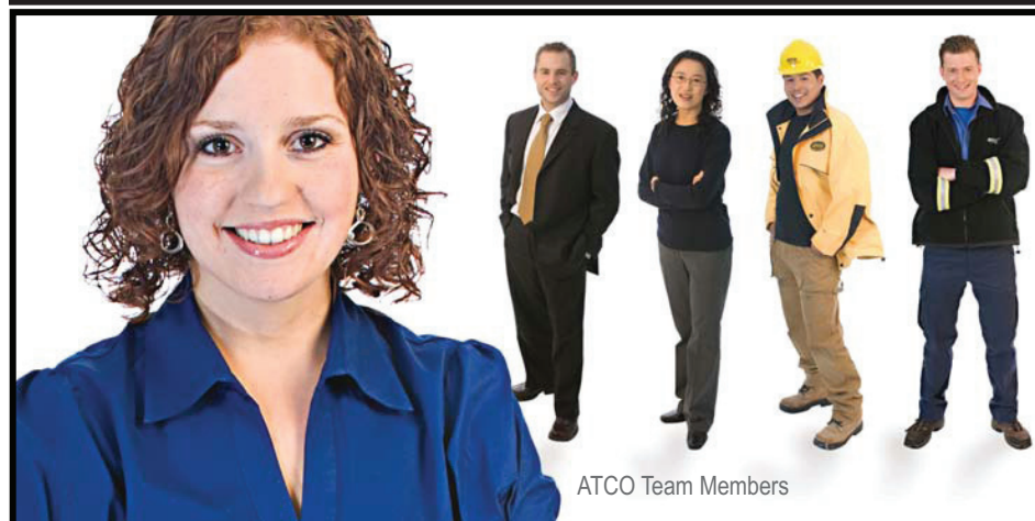
ATCO Team Members